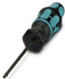
Torque screwdriver, with preset torque of 2.5 Nm and 4 mm hexagonal drive for the pressure nut of the connector hood

Please be informed that the data shown in this PDF Document is generated from our Online Catalog. Please find the complete data in the user's documentation. Our General Terms of Use for Downloads are valid ( http://phoenixcontact.com/download )