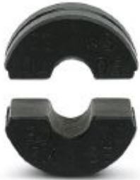
pre-round die (pair), for CRIMPFOX-C50, for sector cable 50 + 70 mm 2

Please be informed that the data shown in this PDF Document is generated from our Online Catalog. Please find the complete data in the user's documentation. Our General Terms of Use for Downloads are valid ( http://phoenixcontact.com/download )