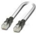
Patch cable, CAT5, assembled, 2 m

Patch cable - FL CAT5 PATCH 2,0 - 2832289