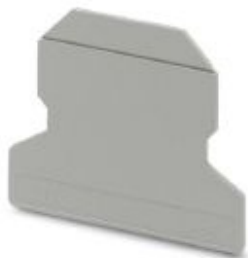
Partition plate, length: 56 mm, width: 1.5 mm, height: 45.7 mm, color: gray

Please be informed that the data shown in this PDF Document is generated from our Online Catalog. Please find the complete data in the user's documentation. Our General Terms of Use for Downloads are valid ( http://phoenixcontact.com/download )